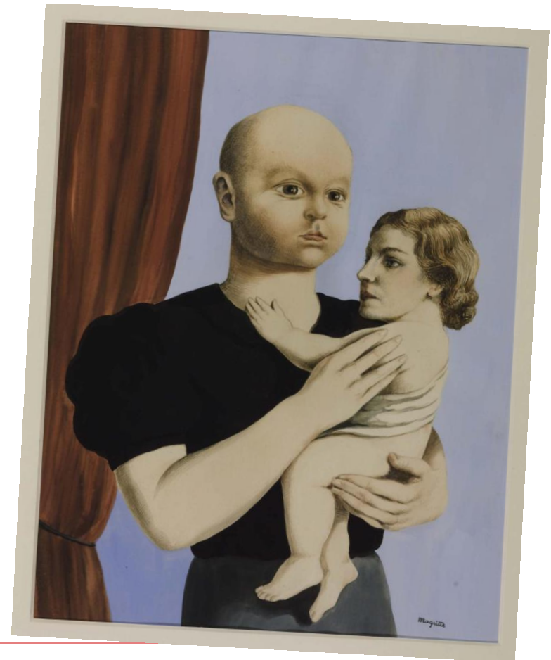
René Magritte, L'Esprit de géométrie , 1937